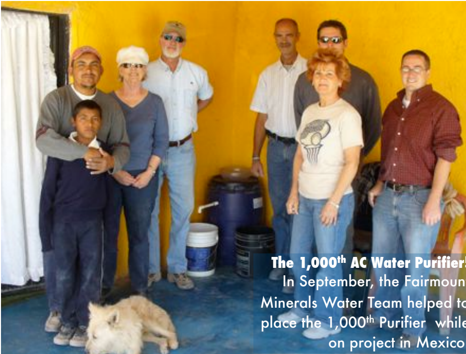
The 1,000 th AC Water Purifier! In September, the Fairmount Minerals Water Team helped to place the 1,000 th Purifier while on project in Mexico.

Management that funded the AC health and hygiene program, and facilitated web communication for the Kids 2 Kids program.