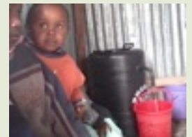
An ACI Water Purifier placed near Isinya, Kenya

ACI is currently directly overseeing programs in four countries, with ACI filters now placed in 20 countries worldwide (due to the success of our affiliate training program). This April, ACI will launch a fifth 'core' program country - we are entering Guatemala . Our founder, Bob McDonald, will be traveling to conduct our training - and ACI staff will work with our Guatemalan contacts to ensure success and expansion through 2010 and beyond.